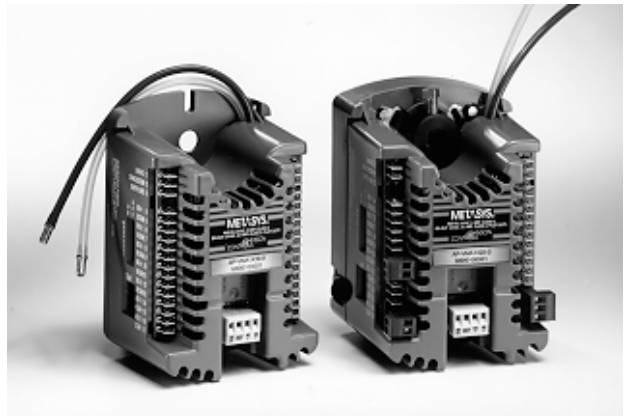
Figure 1: VMA1430 and VMA1410/1420 (1440 Not Shown)

Note: The VMA1440 is used exclusively as part of the Metasys Zoning Package. See the Metasys Zoning Package Product Bulletin (LIT-639050) for details.